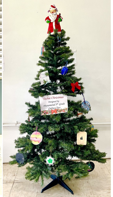
The school cafeteria was decorated with beautiful eco-friendly Christmas trees for everyone to enjoy!