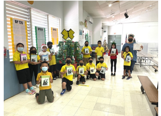
The 3rd grade team pose with their winning tree and student prizes. Students also enjoyed a special movie day in the school cafeteria!